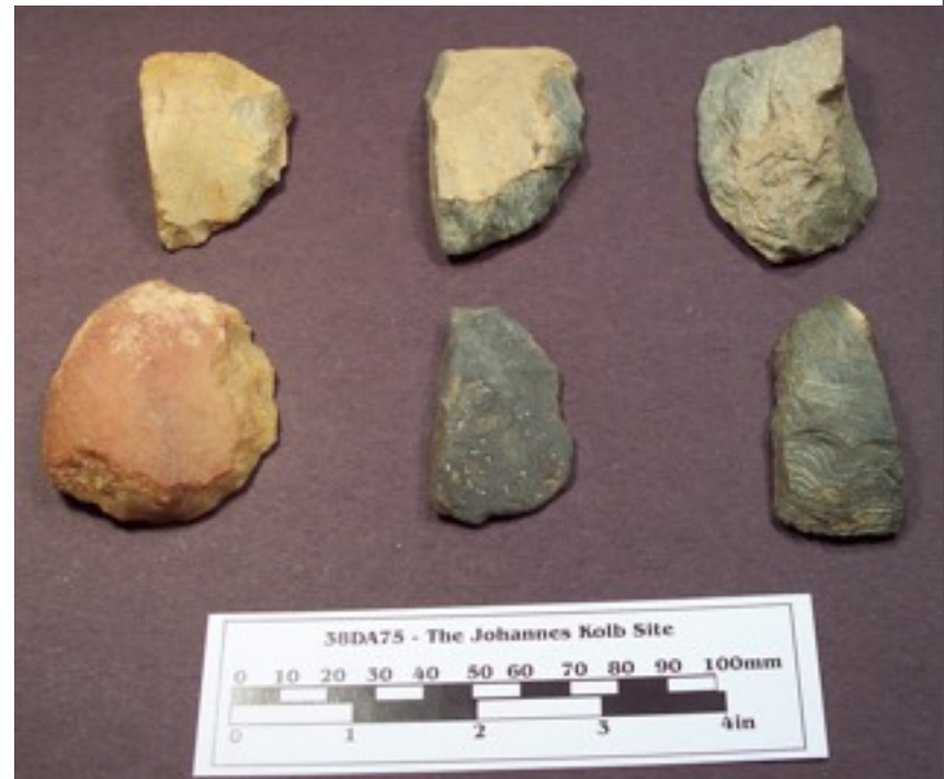
Unifaces Group 11.24. Top Row, Specimen # 687, 1110, 702. Row 2, Specimen # 1006, 759, 842.