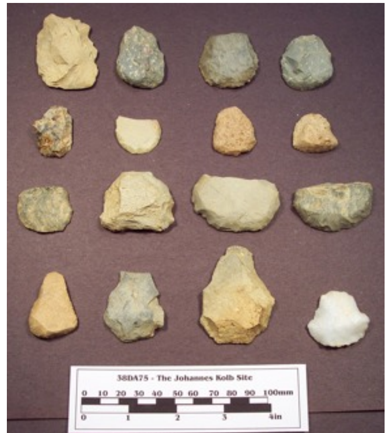
Unifaces Group 11.11- 11.13. Top Row, Specimen # 756, 701, 718, 721. Row 2, Specimen # 817, 1080, 1133, 1252. Row 3, Specimen # 707, 714, 653, 651. Row 4, Specimen # 567, 844, 740, 625.