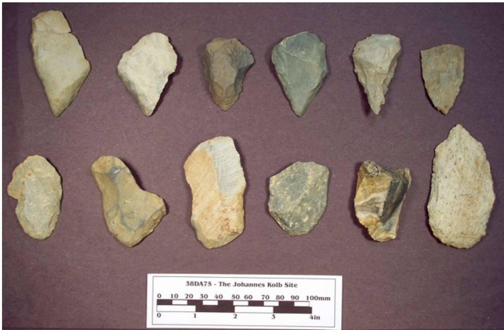
Unifaces Group 11.41 - 11.42. Top Row, Specimen # 855, 1053, 686, 1166, 738, 239. Row 2, Specimen # 969, 627, 682, 684, 1116, 825.