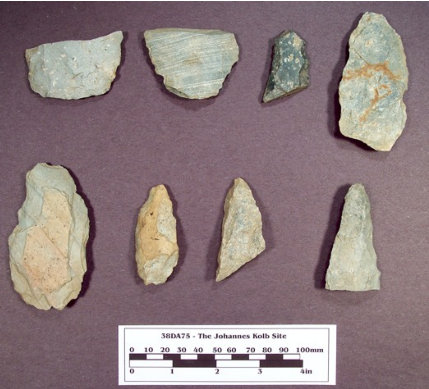
38DA75 - The Johannes Kolb Site