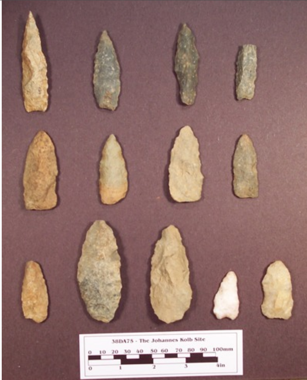
Guilford group, Top Row, Specimen # 607, 437, 31, 30. Row 2, Specimen # 40, 38, 39, 41. Row 3, Specimen # 218, 284, 220, 572, 219.