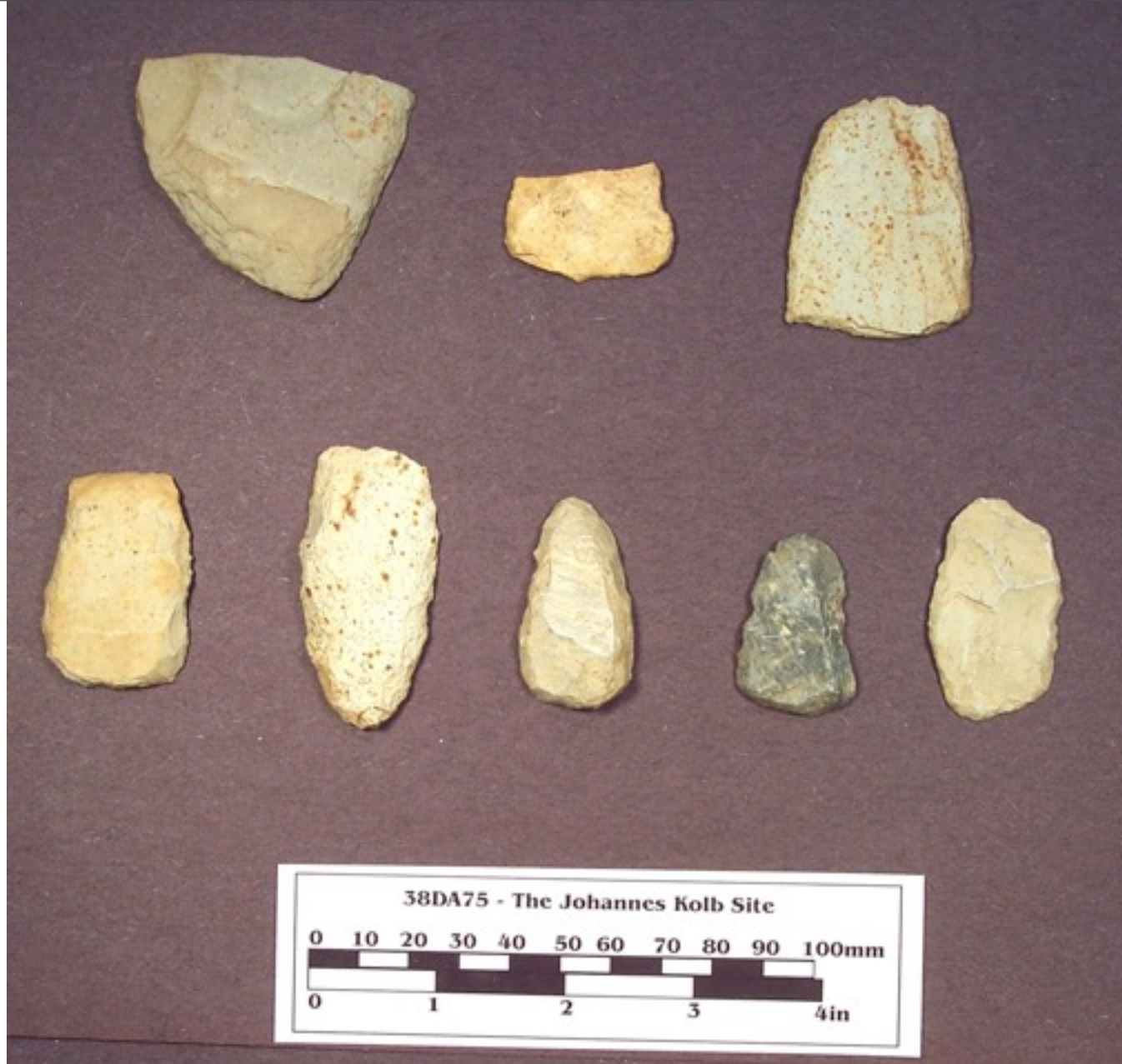
Unifaces Group 11.51 - 11.52. Top Row, Specimen # 853, 1016, 1253. Row 2, Specimen # 639, 723, 638, 748.