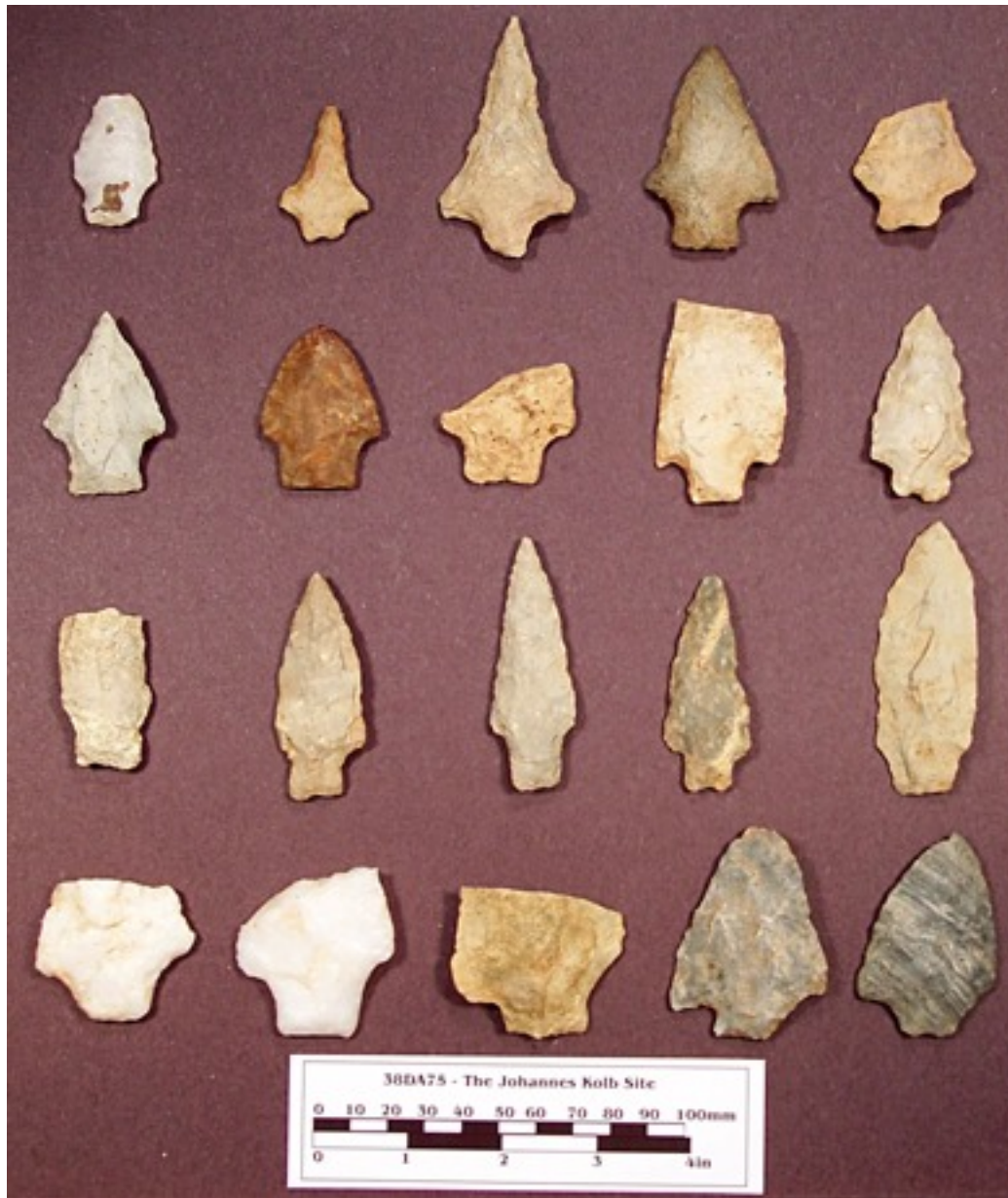
Top Row, Early square stemmed points, Specimen # 120, 608, 675, 115, 113. Row 2, "Savannah River" Specimen # 454, 118, 119, 1179, 435. Row 3 436, 433, 946, 1115, 944. Row 4, Specimen # 455, 116, 117, 456, 591