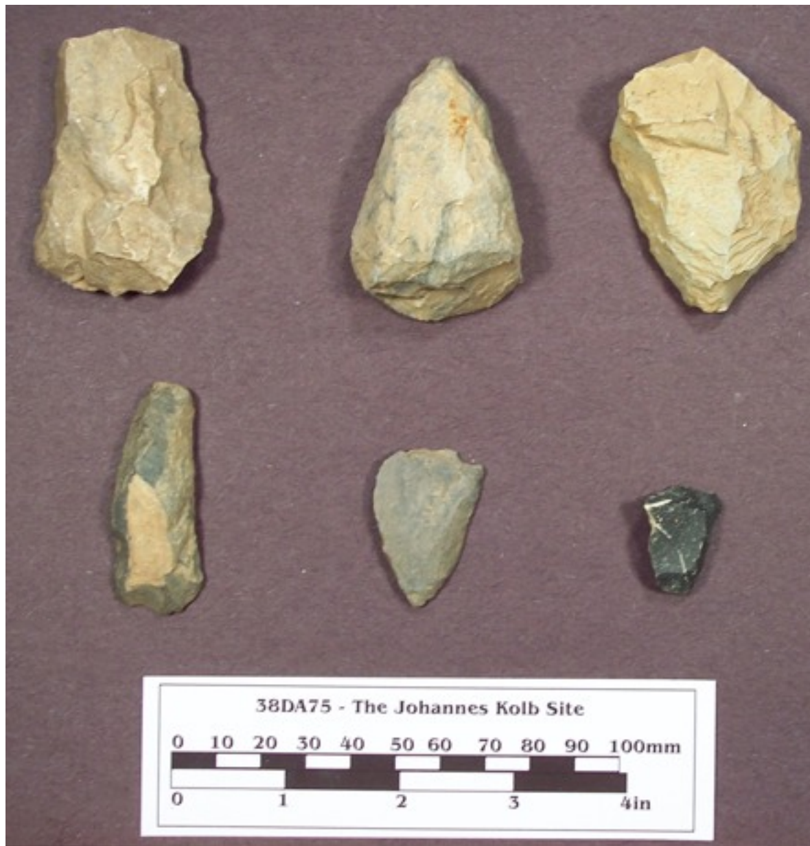
Unifaces Group 11.43 - 11.45. Top Row, Specimen # 124, 712, 1106. Row 2, Specimen # 739, 573, 785.