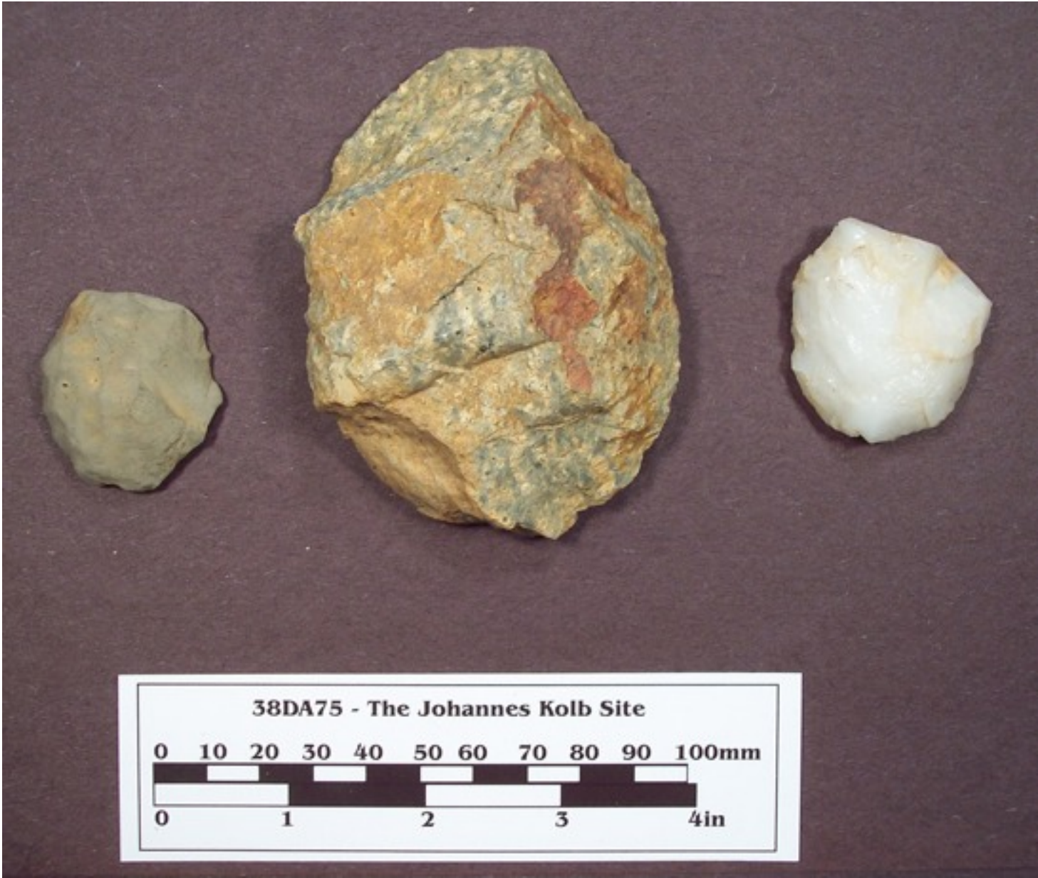
Unifaces Group 11.3. Specimen # 751, 790, 1169