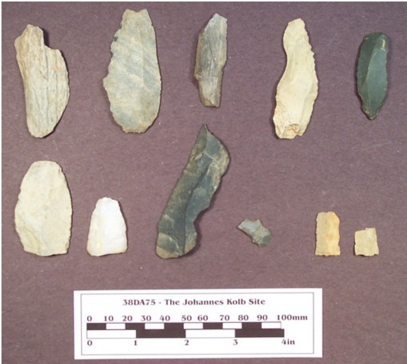
Utilized / Retouched Flakes. Top Row, Group 12.60, Specimen # 735, 1217; Group 12.61 778; Group 12.62, 1030. Bottom Row, Group 12.63, Specimen # 746, 750; Group 12.64, 1009, 1211; Group 12.65, 581, 582.