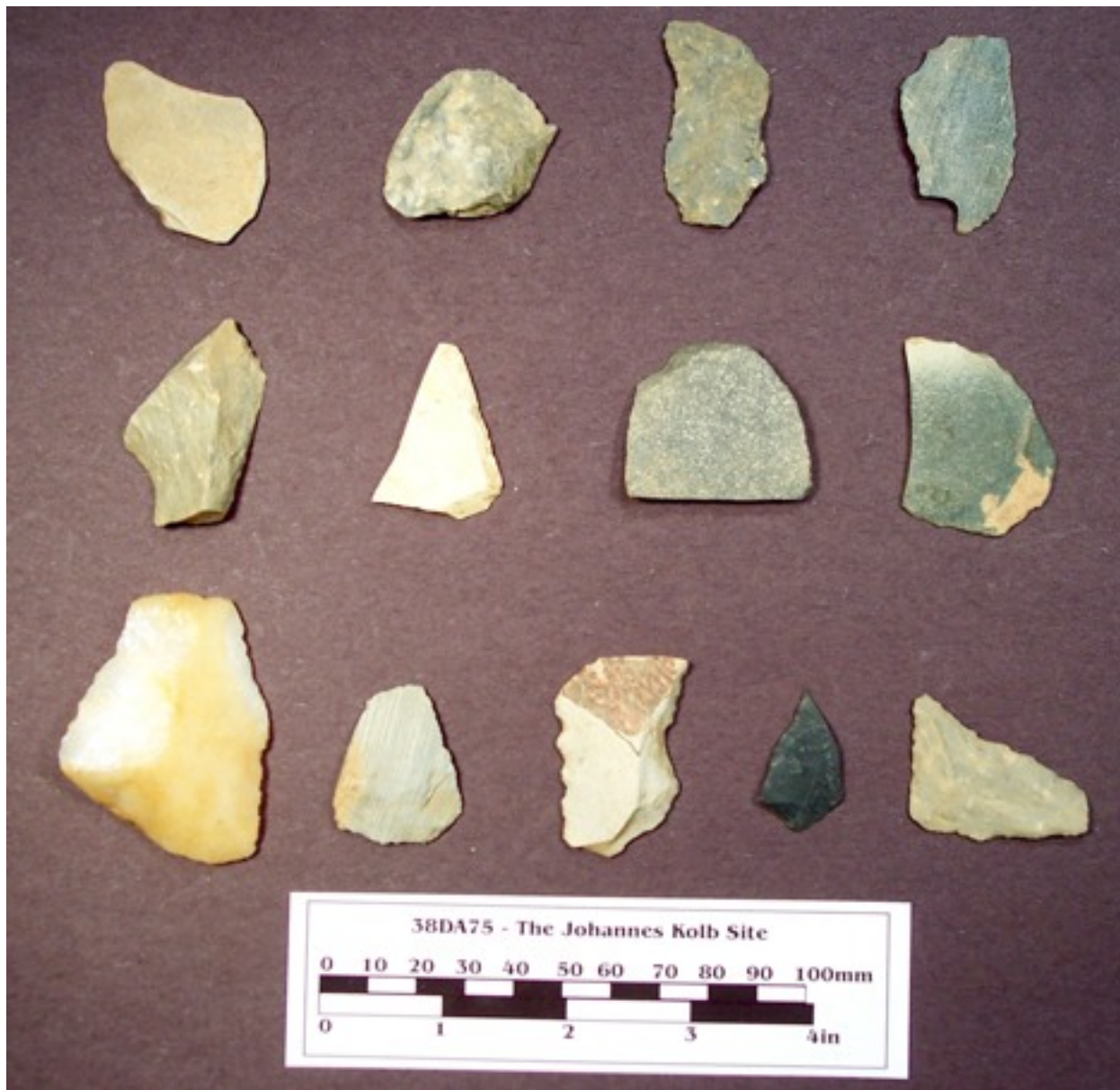
Utilized / Retouched Flakes. Top Row, Group 12.1, Specimen # 1045, 389, 1023, 810. Middle Row, Group 12.2, Specimen # 280, 728, 1071, 1100. Bottom Row, Group 12.21, Specimen # 1051, 736; Group 12.22, 1001, 827; Group 12.23, 987.