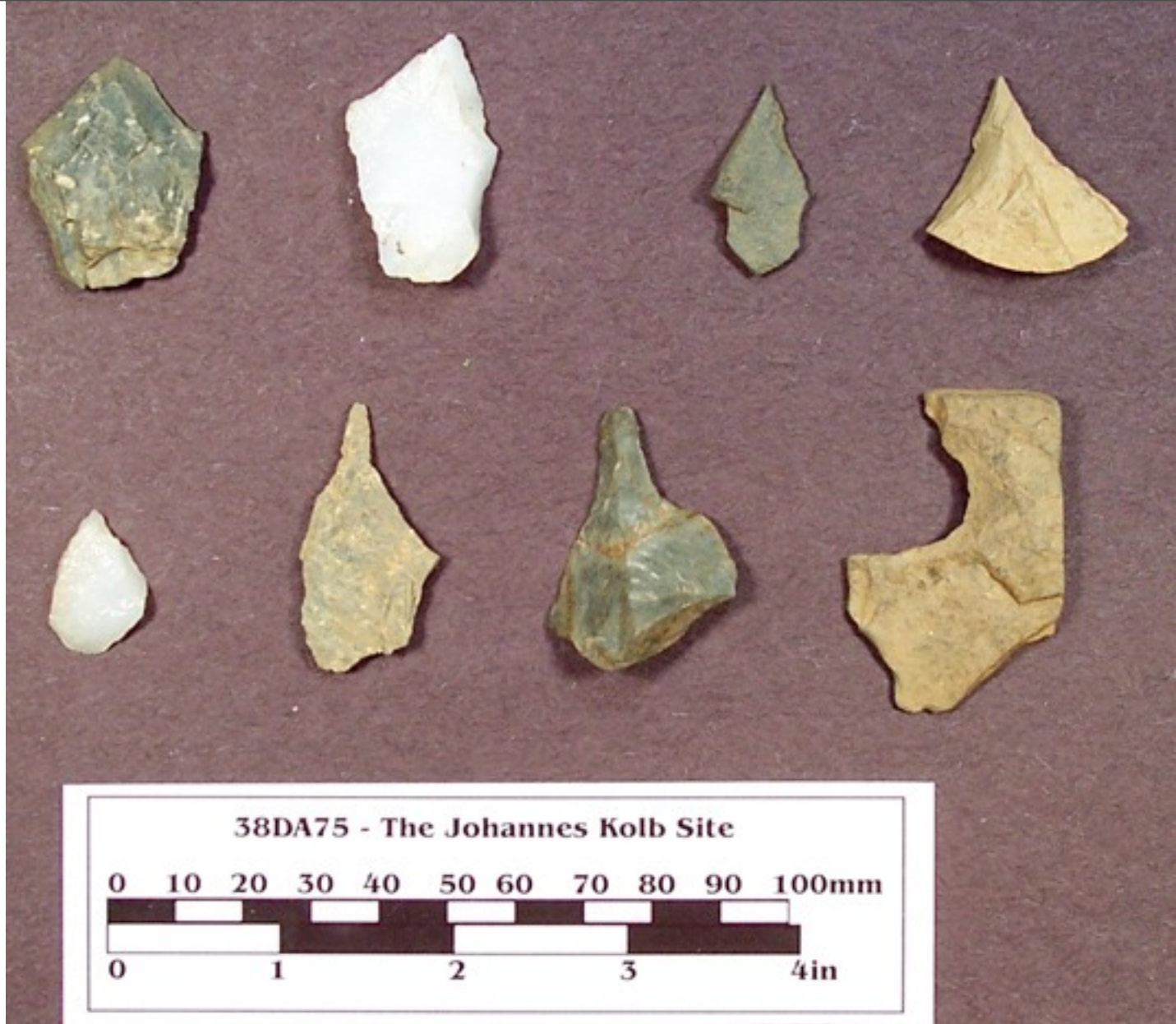
Flake Tools. Top Row, Group 12.31, Specimen # .689, 1031, 1148, 1256. Bottom Row, Specimen # 991; Group 12.4, 1243, 297; Group 12.50, 560.