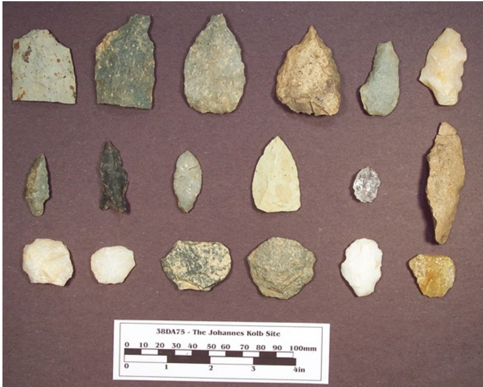
Other Bifacial Tools. Top Row, Group 10.52, Specimen # 262, 1190, 1086. 206, 1174, 1057. Row 2, Group 10.53, Specimen # 440, 910, 1007; Group 10.54, 1049, 238, 1236. Row 3, Group 10.51 Specimen # 947, 548, 561, 562; Group 10.54, 234; 992