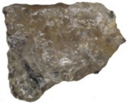
Paleoindian Point Base