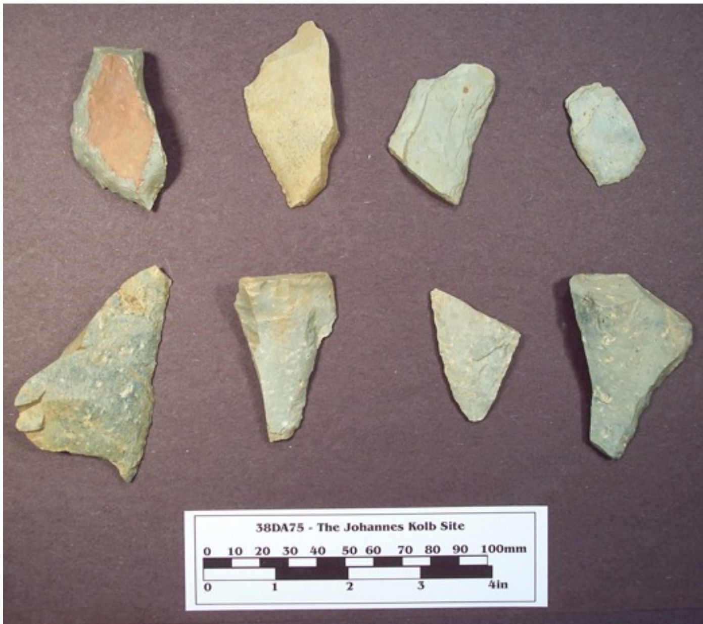
Unifaces Group 11.21. Top Row, Specimen # 1260, 1026, 970, 737. Row 2, Specimen # 123, 766, 650, 774.