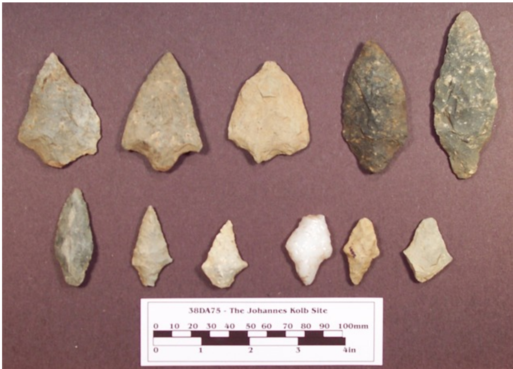
Morrow Mountain group. Top, Specimen 269, 1239, 565, 64, 33. Bottom, Specimen #: 36, 37, 35, 958, 669, 602